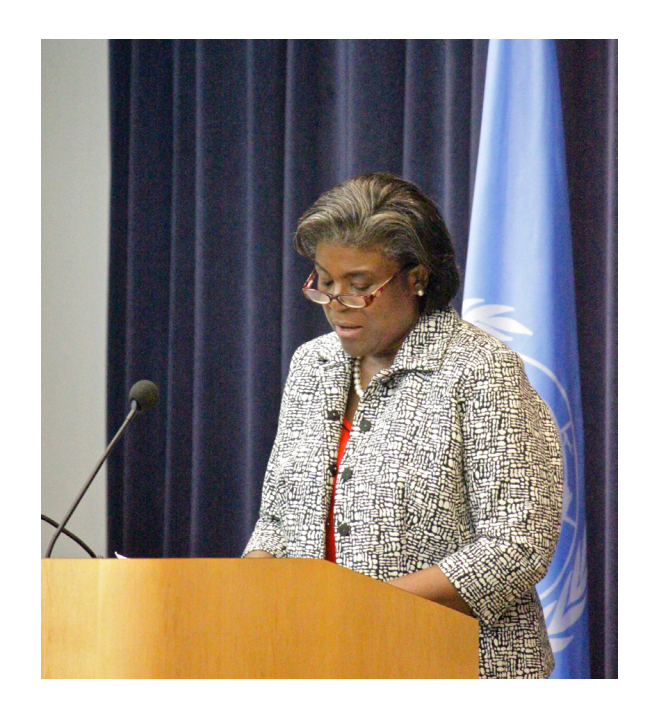
GCDC Spring Model UN Conference at the US Department of State and Pan American Health Organization: Tuesday, May 7, 2013

also put these skills into practice at the May 7th GCDC Spring Model UN Conference held at the State Department.